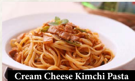
Cream Cheese Kimchi Pasta