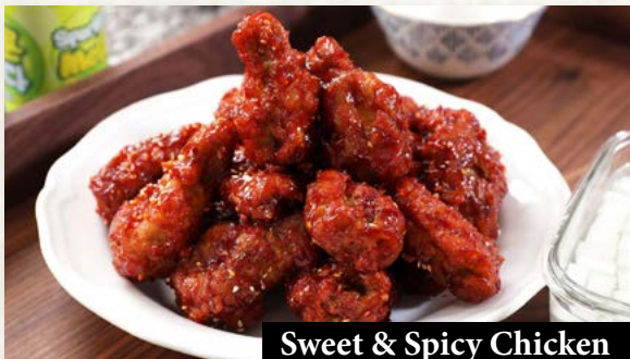
Sweet & Spicy Chicken

stir-fried spicy rice cake, fish cake, egg