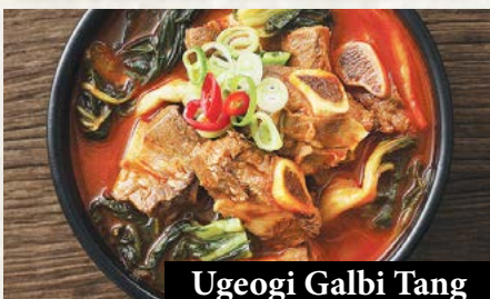
Ugeoji Galbi Tang