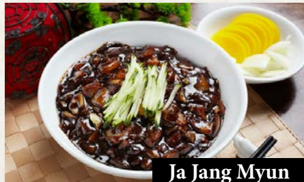
Ja Jang Myun