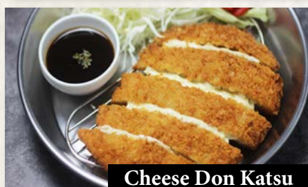
Cheese Don Katsu