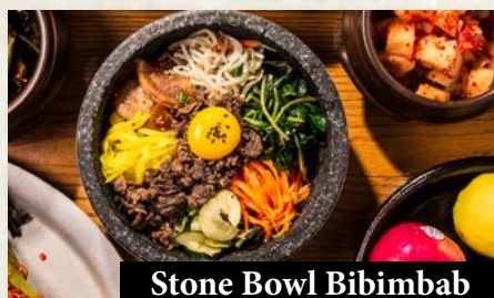
Stone Bowl Bibimbab