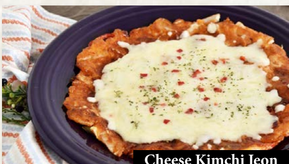
Cheese Kimchi Jeon

Korean pancake with seafood, green onion, vegetable