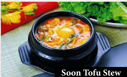
Soon Tofu Stew

spicy tofu stew with vegetable, beef or seafood