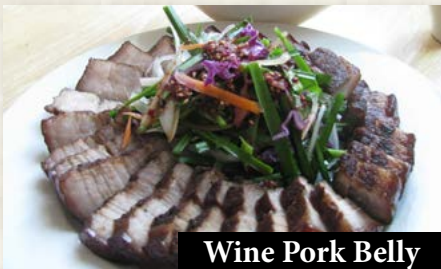
Wine Pork Belly