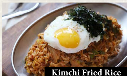
Kimchi Fried Rice